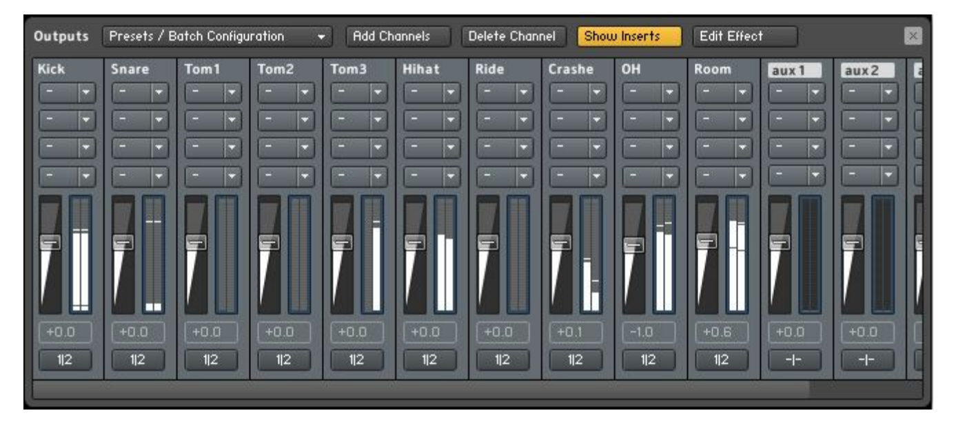
Click each of the 1/2 buttons, and change them to the desired channel number